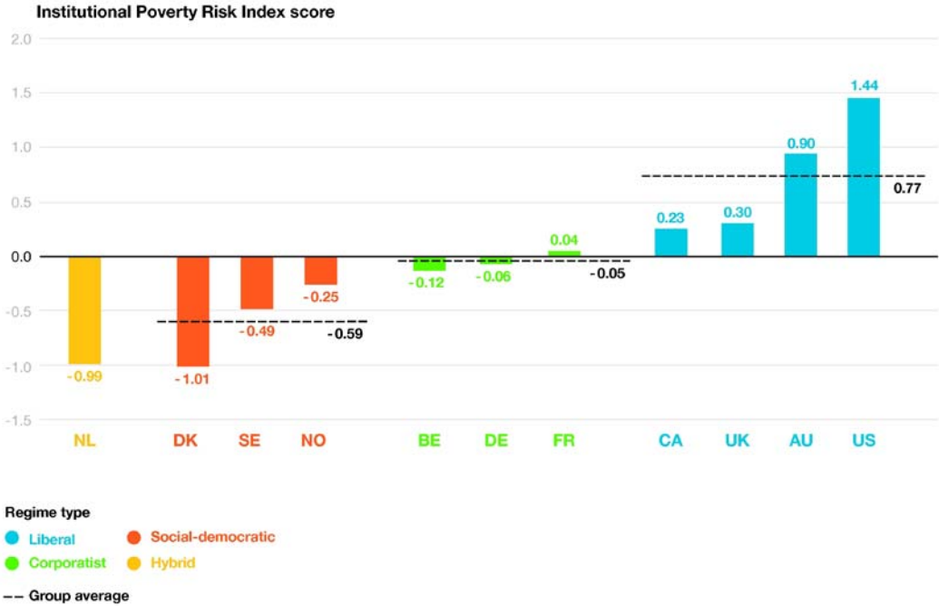
Figure 2 Theoretical institutional poverty risk index for eleven countries, by regime type (1999-2001)