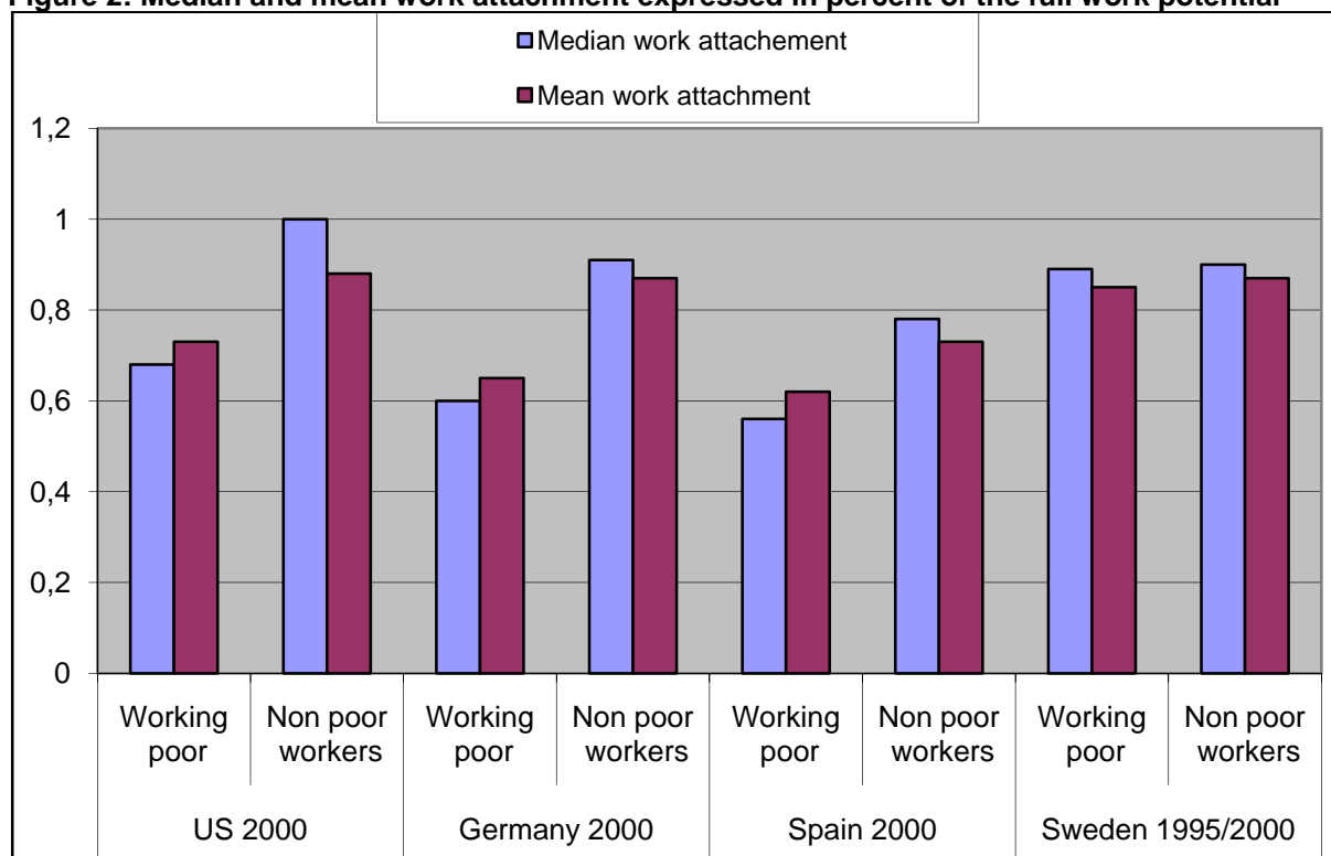
Figure 2: Median and mean work attachment expressed in percent of the full work potential