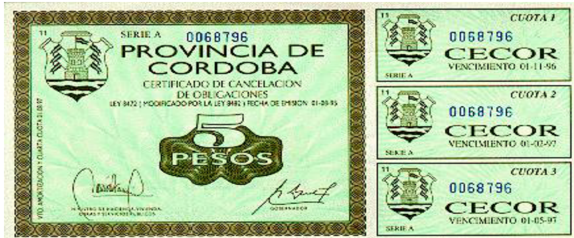
Figure 2: The CECOR: How Córdoba abandoned pesoization