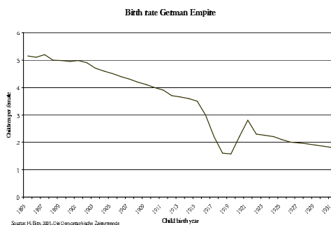
Figure 1: Birth rate, German empire