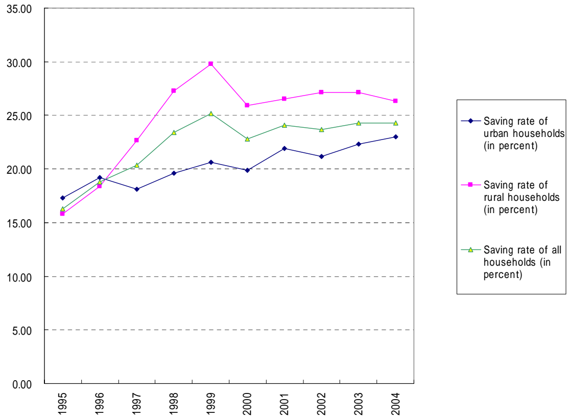
Figure 2: Household Saving Rate in China, 1995-2004

Source: Authors' calculations based on China Statistics Yearbook, 1996-2005 editions