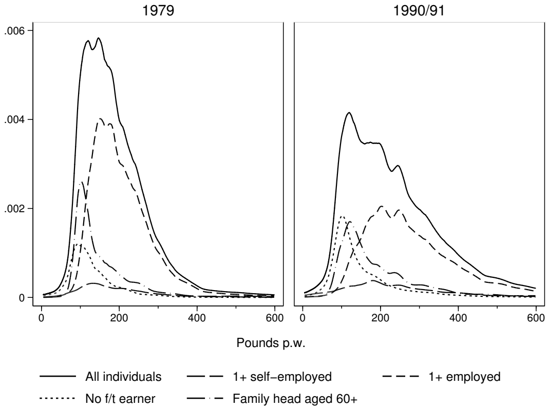
Figure 2: PDFs for 1979 and 1990/91

Note: Each subgroup PDF is weighted by the relevant subgroup population share.