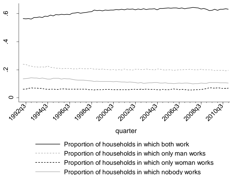
Figure 2: Household/couple types over the business cycle

Although the figure does show some trends, the variations may appear rather small given the severity of the recession; one possible reason is that the unemployed represent only a relatively small proportion of the total active population (about 5%-10%). However, this overall picture of relative stability also reflects only the net effect of job losses and job gains and consequent movements between household types. It potentially obscures any operation of the AWE (if one partner loses a job but the other finds a job there is no net change to the number employed in the household), as well as changes in job loss and finding rates over the business cycle. In order to examine the dynamics of employment more directly, we next look at employment transitions for each household type.