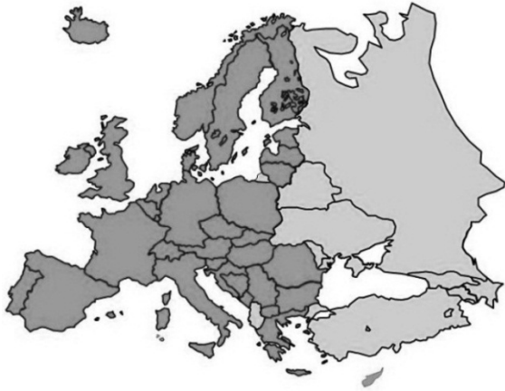
Member countries of ENTSO-E (ENTSO-E 2010: 23).