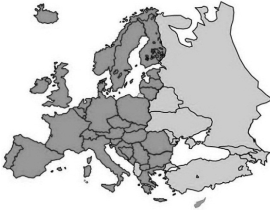
Member countries of ENTSO-E (ENTSO-E 2010: 23).