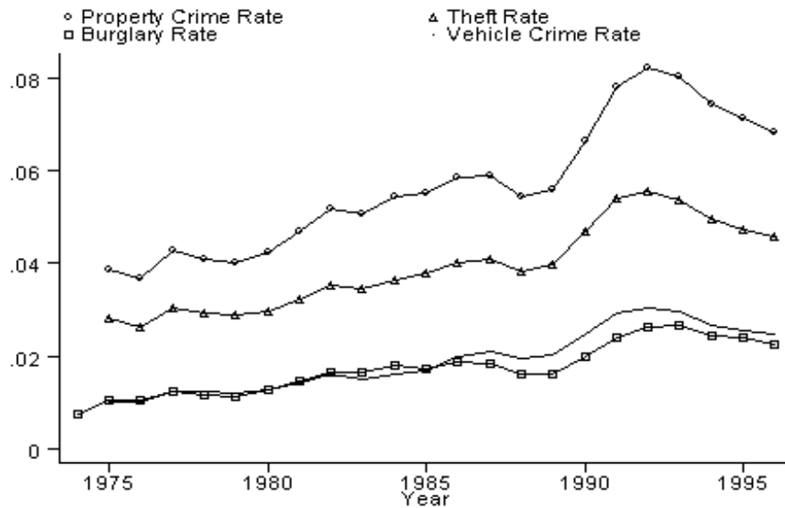
Figure 1: Property Crime Rates per person in England and Wales, 1974-96

Figure 1 reports what has happened to the property crime rate, to its components and to the vehicle crime rate between 1975 and 1996. There is a clear rise in the property crime rate, from around 38 crimes per 1000 people (.038) in 1975 up to around 68 crimes per 1000 (.068) population by 1996. Looking at the separate components reveals rather similar scale increases for theft and burglary. The same pattern, with a larger percentage rise compared to the initial level, occurs for vehicle crime, which rises from 10 crimes per 1000 to 25 crimes per 1000 between 1975 and 1996. Notice also the dip down in crime from 1992 onwards, revealing a peak in the crime rate in that year, at 80 property crimes and 30 vehicle crimes per 1000 people in England and Wales.