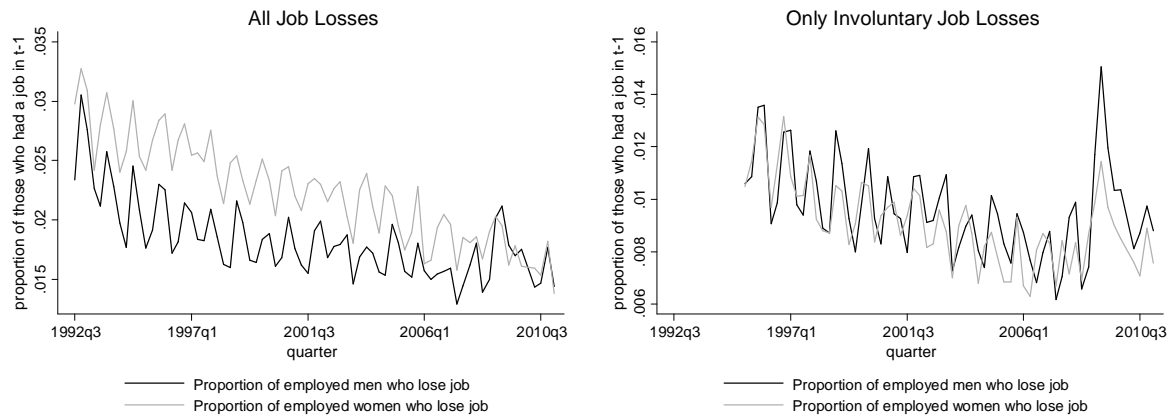
Figure 1: Job losses over the business cycle

that households suffering job losses during this period were facing a much tougher economic environment than their counterparts in the preceding years.