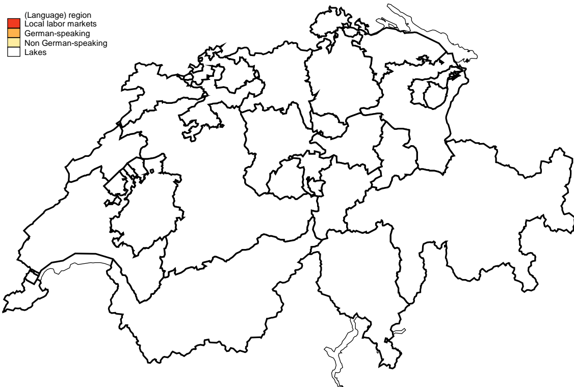
Figure B.1: Geographical area covered by LLMs