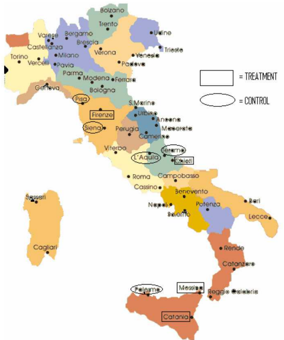
Fig. 2.— Regions where both AlmaLaurea and non- AlmaLaurea universities are located