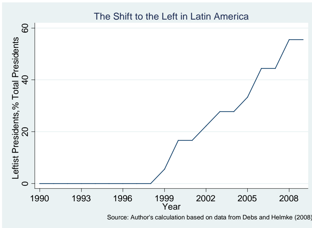
Figure 1. Left-Wing Presidents in Latin America