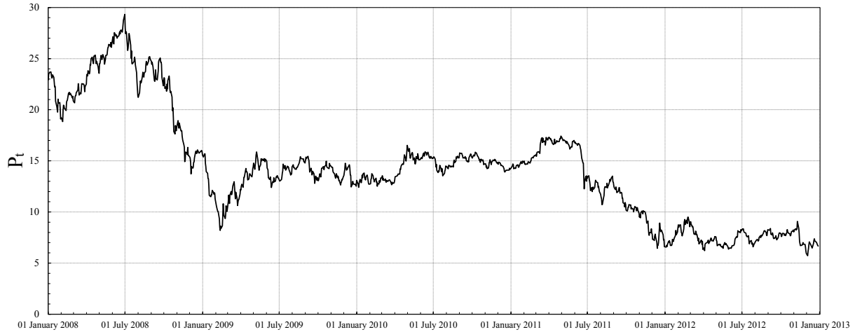
Figure 1: EUA price development during Phase II.

bn including credits from the project-based mechanisms (World Bank 2012). The market has been growing rapidly during the first two commitment periods and is now the largest emission market in the world. Several types of transactions and trading products have evolved: EUAs can be traded via bilateral, over-the-counter or organized markets. In addition to the spot market, there is a lively exchange of futures, options and swaps between the interest groups. Bilateral and over-the-counter transactions dominated trading at exchanges during the first compliance period. Therefore liquidity at exchanges was low leading to a highly volatile starting of the market (Rotfuß 2011). However, volumes traded on exchanges increased heavily since the beginning of the Phase II. The most liquid derivatives market is situated at the European Climate Exchange (ICE/ECX; London) where approximately 90 percent of the futures contracts are traded. Before its closure in December 2012, the most liquid spot market was Bluenext (Paris). About 70 percent of the daily spot transactions were settled at this exchange.