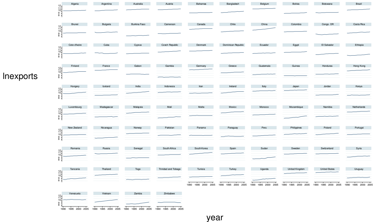
Figure 1: Time series plots for ln(exports)

DR, Costa Rica, Cote d'Ivoire, Cuba, Cyprus, Czech Republic, Denmark, Dominican Republic, Ecuador, Egypt, El Salvador, Ethiopia, Finland, France, Gabon, Gambia, Germany, Greece, Guatemala, Guinea, Honduras, Hong Kong, Hungary, Iceland, India, Indonesia, Iran, Ireland, Italy, Japan, Jordan, Kenya, Luxembourg, Madagascar, Malaysia, Mali, Malta, Mexico, Morocco, Mozambique, Namibia, Netherlands, New Zealand, Nicaragua, Norway, Pakistan, Panama, Paraguay, Peru, Philippines, Poland, Portugal, Romania, Russia, Senegal, South Africa, South Korea, Spain, Sudan, Sweden, Switzerland, Syria, Tanzania, Thailand, Togo, Trinidad and Tobago, Tunisia, Turkey, Uganda, United Kingdom, United States, Uruguay, Venezuela, Vietnam, Zambia, Zimbabwe