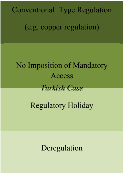
Figure-3: Policy approaches for NGA regulation

The above figure incorporates four different options related to how to deal with FTTX platforms, spreading over between deregulation and maximized regulation, which is