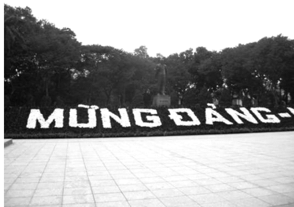
Private Photo, 2008.

Conclusively, public space is seen here as the physical expression of the state's "vision of the future" in terms of Marxist-Leninist ideology. Rather than being public space, squares and monuments are official spaces controlled by the state and often not freely accessible. To comprehend the domination of one group in giving meaning to urban objects, Kong and Law refer to Gramsci's (1973) concept of 'ideological hegemony'. The ruling group presents ideas and values which are perceived to be 'natural' or 'commonsense' by the rest of society. Landscapes then have the power to institutionalise the given order, "thus contributing to the social constructedness of reality" (Kong and Law, 2002, p. 1505). Yet these dominant ideas can be contested. According to Zukin (1991, p. 16, 18ff.) the landscape is formed by practices of both domination and resistance. That is what makes the social microcosm.