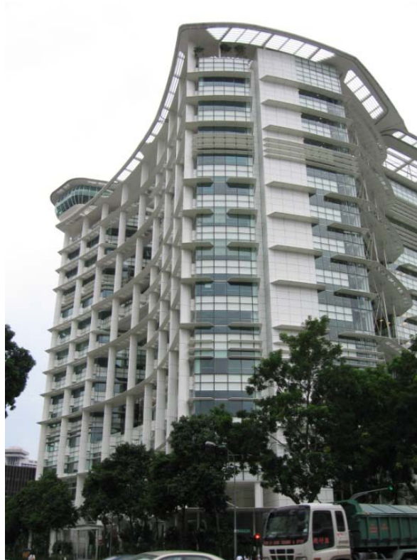
Diagram 9: The New National Library Building at Victoria Street

The new building of the Lee Kong Chian Reference Library 13 , the National Library of Singapore opened on 22 July 2005, 1.2 km or a 15 min foot walk north of „The Esplanade – Theatres on the Bay“. It is therefore located in walking distance to the arts, cultural and museums district, the creativity hub, of Singapore.