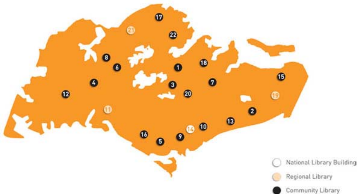
Diagram 7: Network of National, Regional & Community Libraries in Singapore 12