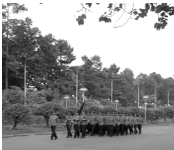
Private Photo, 2007.

“Parades, inaugurations, processions, coronations, funerals provide ruling groups with the occasion to make a spectacle of themselves in a manner largely of their own choosing” (Scott, 1990, p. 58).