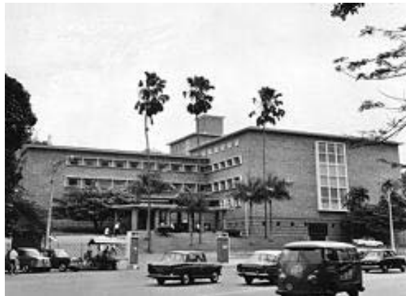
Diagram 6: The National Library Building at Stamford Road

Following a suggestion by Sir Stamford Raffles, the foundation stone for Singapore's first public library, the „Hullett Memorial Library“, was laid in 1823 and opened in 1837 together with Singapore's first major educational institution, The Singapore Institution. It was open to students and staff. Members of the general public were charged 25 cents a month for usage. In 1874, a small museum on Malayan history was attached to the library and was renamed into „The Raffles Library and Museum“. It consisted of a reference library, a lending library and a reading room. In 1875, over 4000 visitors were received ranging from naval officers in transit to locals (NL, 2009). Two weeks before Singapore fell to the Japanese on 15 February 1942, the British and Australian forces occupied the library as a Regimental Aid Station. During the following three and a half years of Japanese occupation the library was closed, except on 29 April 1942, for the occasion of the birthday of the Japanese Emperor. Differently to some libraries in Malaya, the Singaporean library merely suffered little destruction, with only 500 reference books lost.