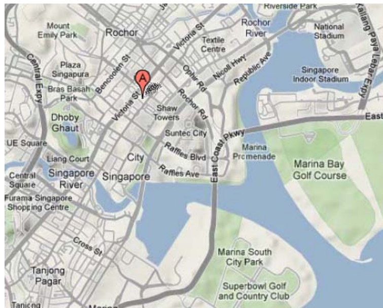
Diagram 8: The National Library