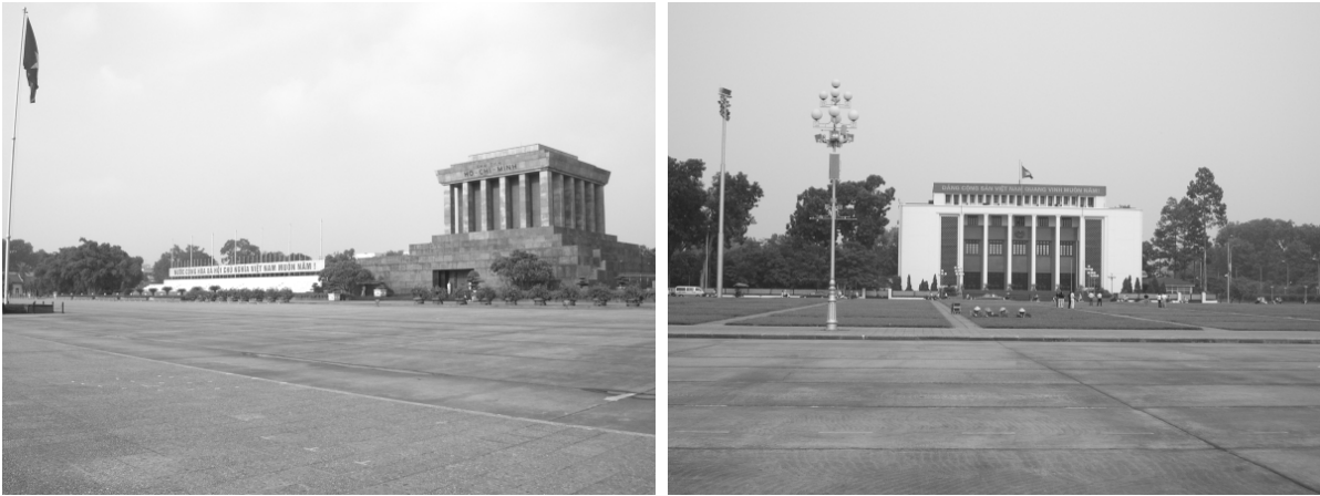
Diagram 4 and 5: Ho Chi Minh Mausoleum and National Assembly