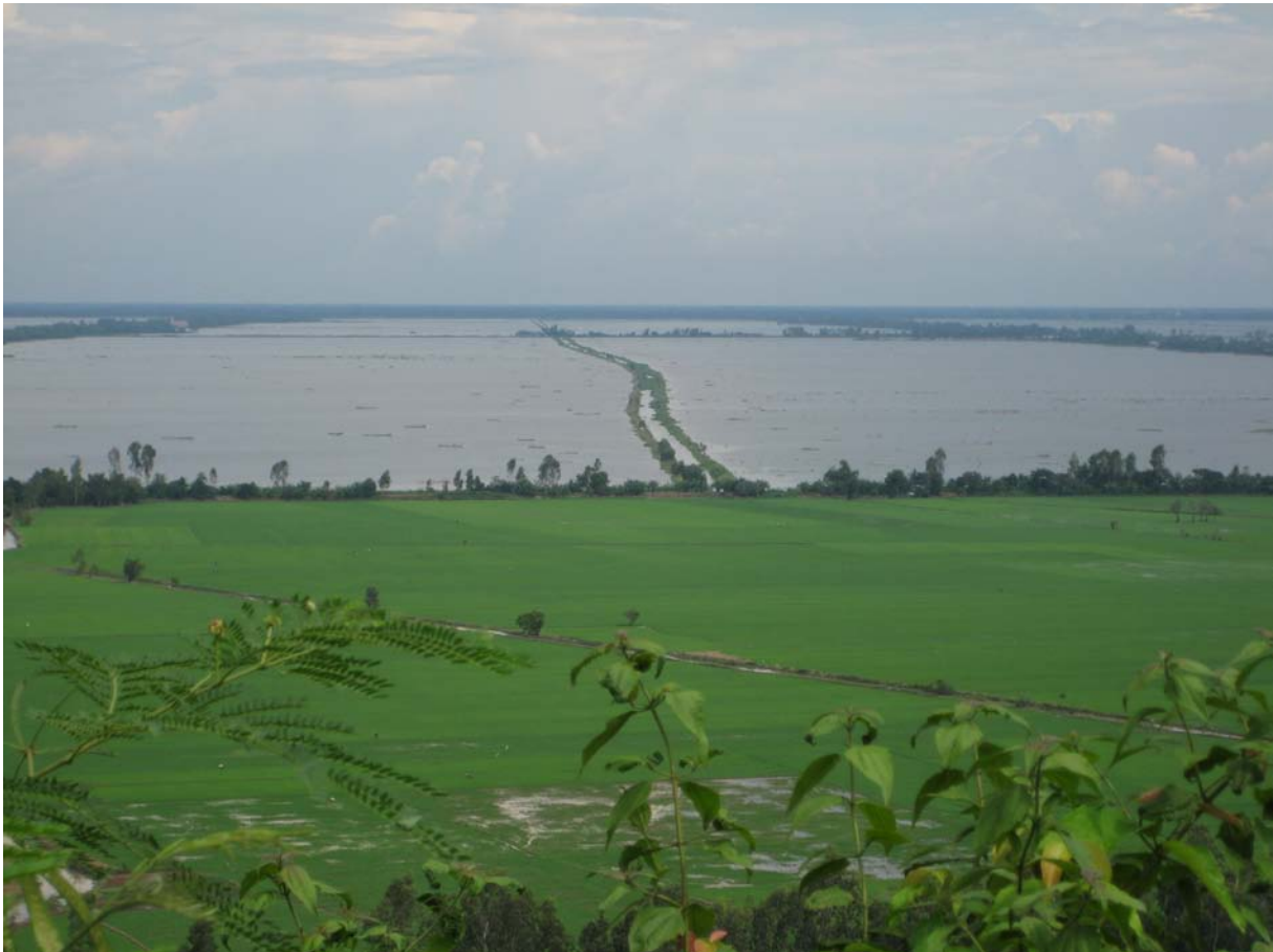
Picture 1 Flood management border lands: Green fields (3 rd crop) in neighboring province An Giang and seasonal floodplains in Can Tho City Province (Photo: J. Ehlert 2008).