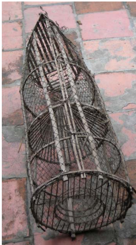
Picture 4 Knowledge artefact: Hand-made bamboo trap for wild fishing (Photo: J. Ehlert 2008).

The exchange of knowledge of course is not always strategically framed but can also be restricted by technical limits. The technical limit of sharing is determined by the tacit feature of knowledge. Local knowledge is characterized by its strong component of being knowledge as practical experience and routine. Tacitness defines the sphere of non-verbalizable 12 process-knowledge that effectively informs our everyday- or specialized knowledge-embedded actions and artefacts. Besides local knowledge as knowledge and practices based on everyday experiences generally endows actors with certain frames of reference for interpretation that enables them to meaningfully act in the social world they live in (Schütz/ Luckmann 1973), knowledge can be also embedded in objects (Antweiler 1995: 29) which are here referred to as 'artefacts'. Hand-made bamboo traps e.g. in this context would be a typical knowledge artefact that is created by practical routines and the know-how of putting different materials efficiently together as a first step to obtain a good catch of fish.