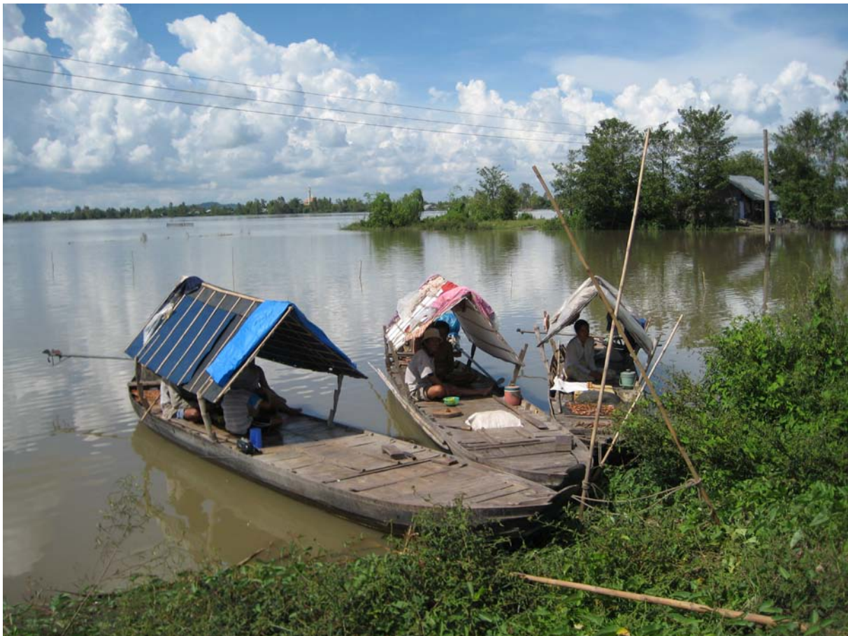
Picture 2 Seasonal migration: Landless people living on their boats for wild capture fisheries in the floodplains (Photo: J. Ehlert 2008).