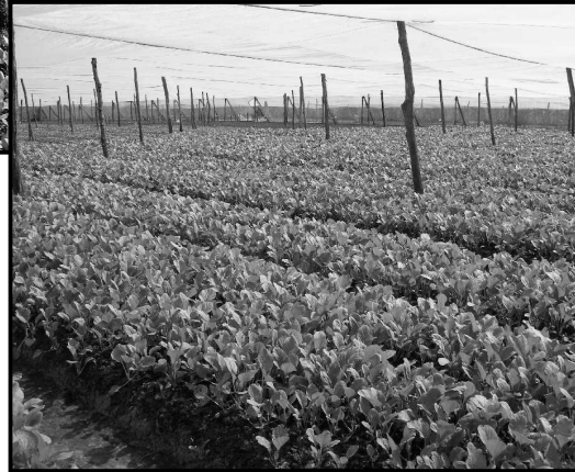
Figures 2 and 3: Protected Cultivation and Good Farming Practice in Pekan Baru

Both government officials and farmers were invited to visit Singapore where they were exposed to local farming techniques, modern supermarkets etc. aimed at understanding the Singapore market and their prospective customers (Helmstaedter 2003; Von Krogh 2003). A significant element of the knowledge transfer between both countries was the establishment of the Agri-Processing centre in Pekan Baru. Its packing house plays a crucial role in preserving the cold chain and thereby the quality and freshness of the vegetables. The low temperature slows down the metabolism rate of the vegetables which remain fresh and attractive. Pekan Baru farmers were trained in relevant SOPs, to sort the vegetables, to pack them according to foreign specifications and to ship them properly.