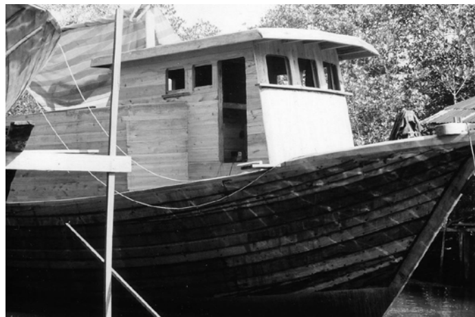
Figures 5 and 6: Construction of Boat in Bintan Boatyard

Indonesia's government provided land (total cultivation size = 10 ha) and low interest loans to farmers in Pekanbaru to enable them to participate in the project.