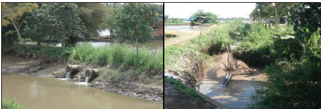
Picture 1: Left: Untreated waste water discharge at a Pangasius farming site; Right: Pond mud and untreated waste water being discharged into open surface waters.

The lead on state legislation in aquaculture is principally taken by the Ministry of Natural Resources and the Environment (MONRE) and by provincial authorities. In terms of environmental governance they are responsible for directing, guiding and supervising the implementation of legislation on environmental protection in aquaculture. The General Department of Aquaculture, which belongs to the Ministry of Agriculture and Rural Development (MARD), is responsible for environmental protection in aquaculture 3 , whereas the Department for Science, Technology and the Environment (also MARD) is in charge of environmental management in processing companies 4 . Waste water from aquaculture and processing companies has to meet national standards on waste water quality, but its management is still considered a critical issue (CTU 2011). Currently, the main environmental challenges are seen in water pollution from aquaculture and processing companies, as Picture 1 illustrates: