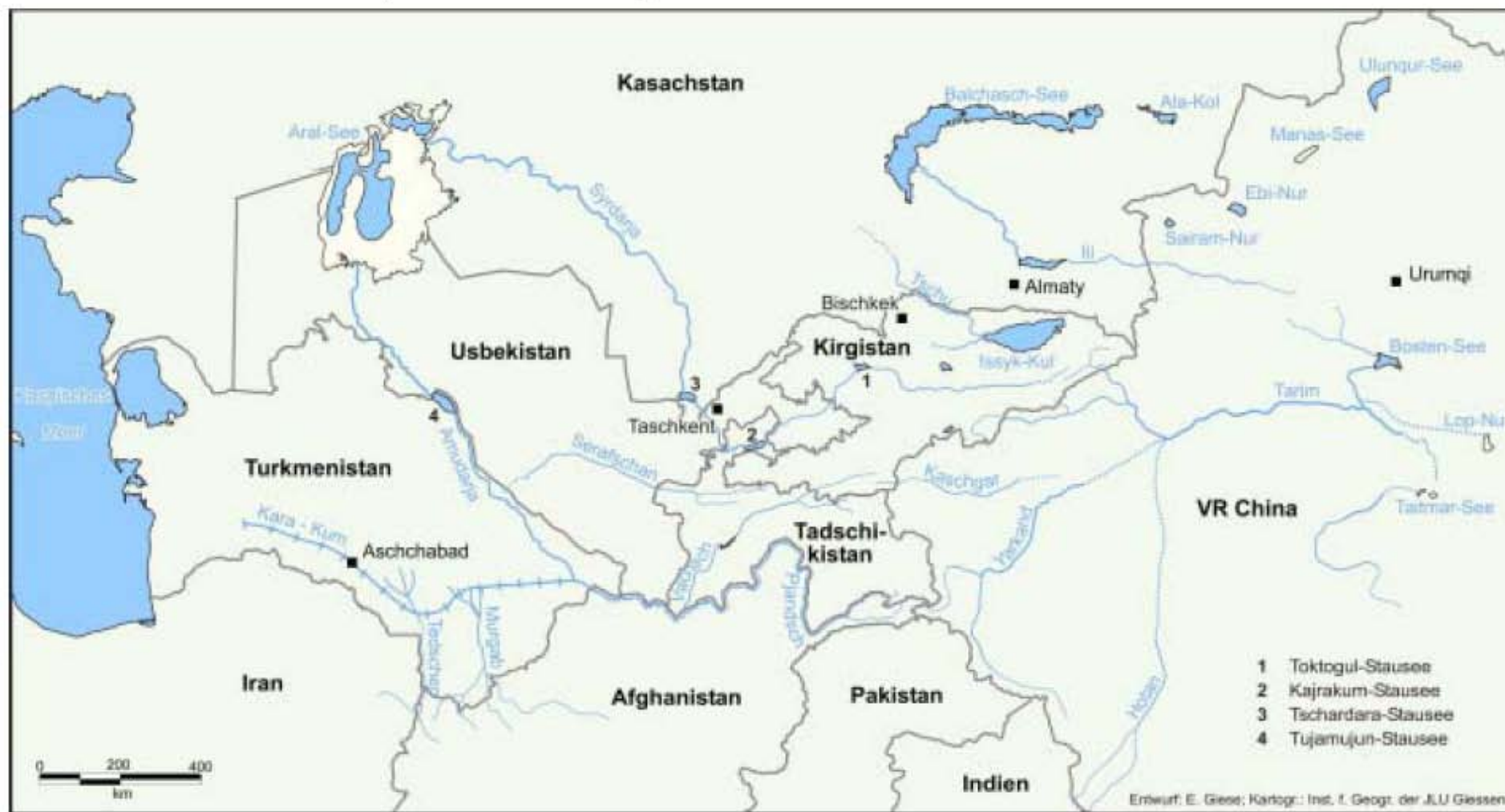
Abb. 1: Übersichtskarte Zentralasien (West- und Ost-Turkestan)