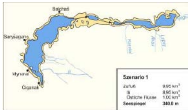
Fig. 3: Development scenario: Diminution of the Balchasch lake

Balchasch lake is currently recovering from its all-time-low (1986), which is commonly ascribed to a transformation-induced decrease in the irrigation agriculture in Kazakhstan, higher precipitation and improved permeability capacities of the Ili deltas, such scenarios should not be ignored (Giese et al. 2004: 28). The Kazakh side is also concerned by Chinese plans to diverge a 300 km long canal from the Irtysch.