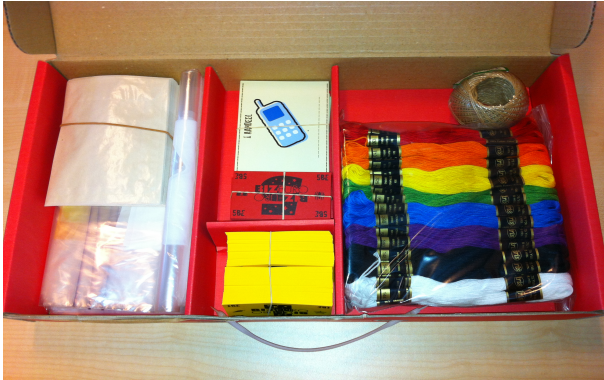
Figure 1: Course material

from start-up to liquidation. Only the first day starts with a theoretical introduction on entrepreneurship. At the start of the practical part on the first day, the teacher divides the class into teams of five or six children. Each child then writes an application letter applying for his/her preferred role within their team. The positions to be fulfilled are: General Manager (CEO), Finance Director (CFO), Director of Product Design, Director of Manufacturing, Marketing Director, and Sales Director. The teacher matches the candidates to positions based on their knowledge of the child, the child's application letter and the job descriptions provided in the course guidelines. Team members fulfill their specific roles besides working (and learning) together as a team.