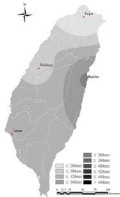
Figure 1 10-year return level