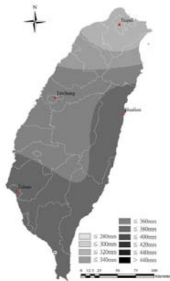
Figure 2 20-year return level