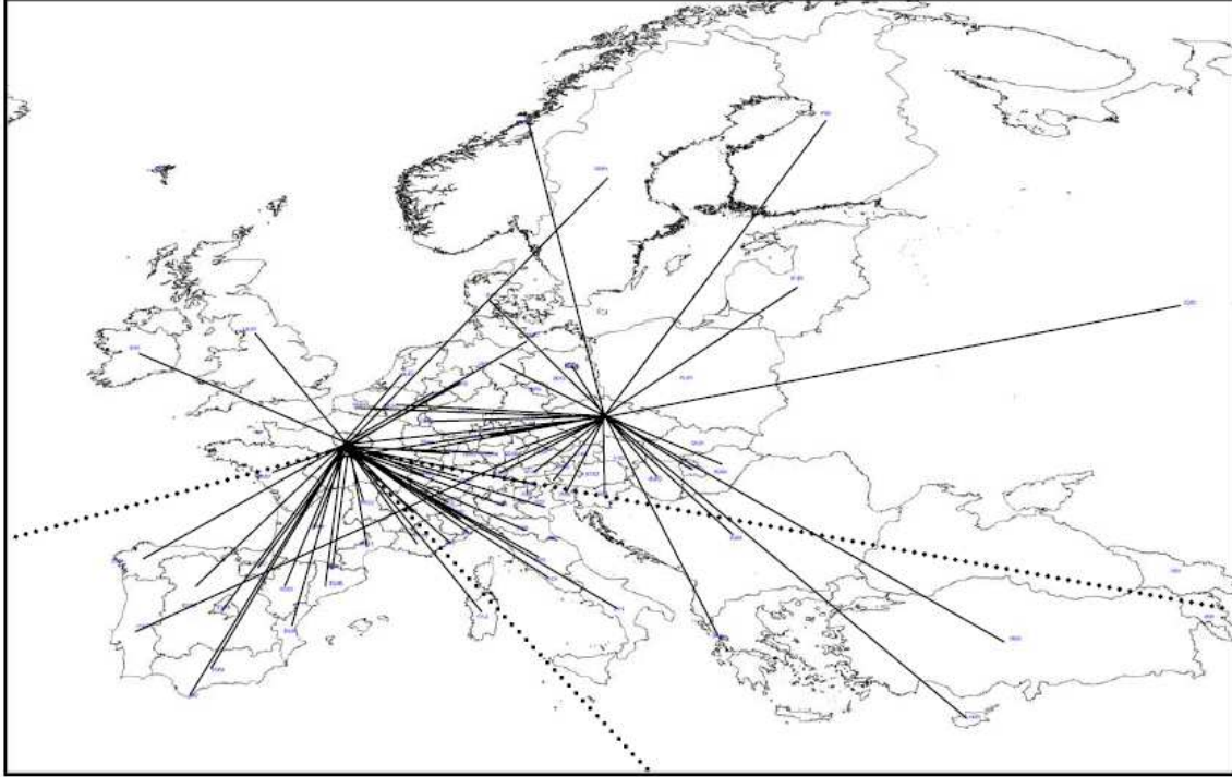
Figure 2: Paris-Prague Hub-Spoke International Network

Partially balanced, demand weighted distance was defined in the objective function of an allocation, integer linear program in order to develop a basic network for each of the HS airlines. There are many possible methods of producing a connected HS network, the most direct of which is to simply connect spoke nodes to a chosen set of hub nodes according to minimum distance. Alternatively a more balanced solution could be sought as presented in the integer linear program in equation (12).