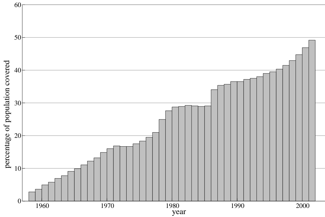
Figure 2: supplementary private health insurance coverage in Ireland