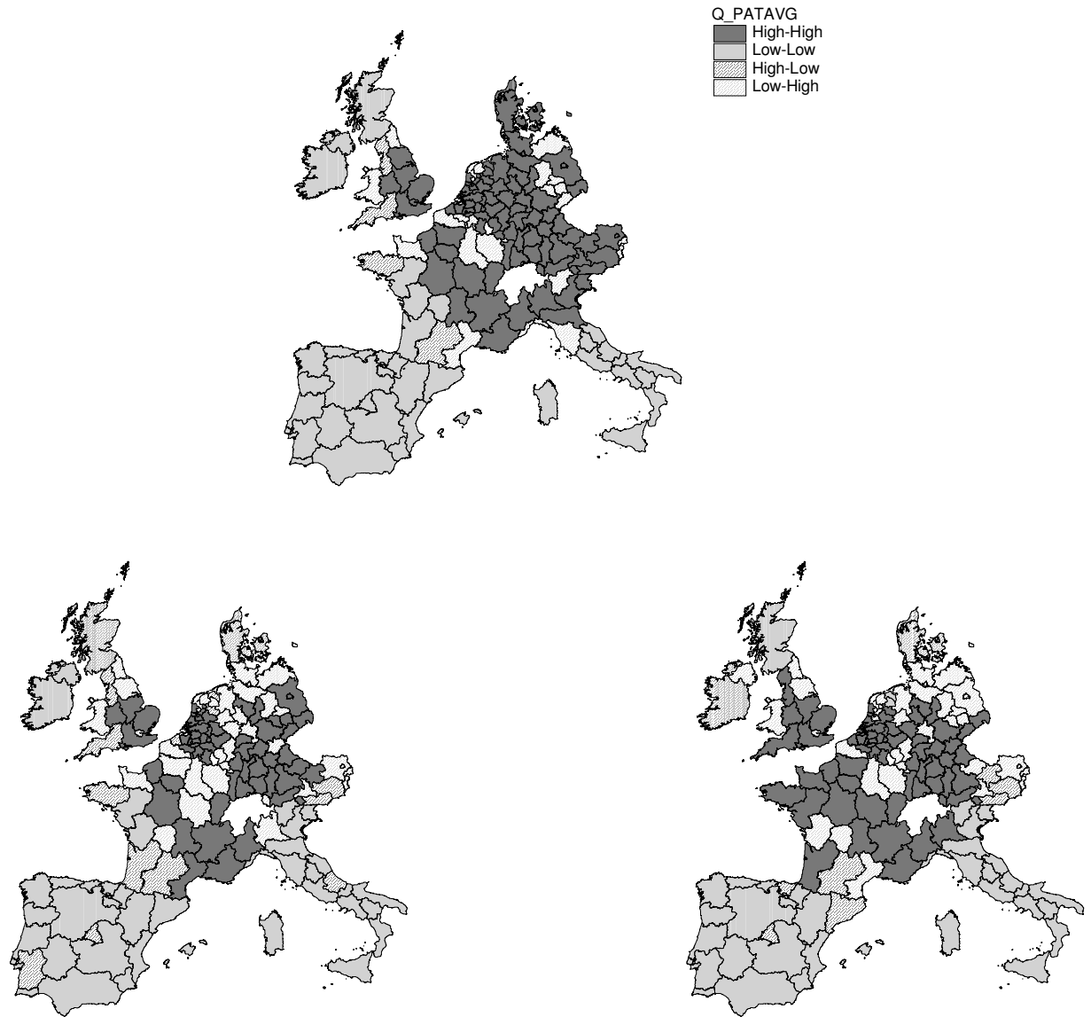
Figure 2: Moran scatterplot maps for patent applications 2000–2002 (top), R&D intensity in all sectors (bottom-left), and R&D intensity in the private sector (bottom-right)

The traditional Moran's I measure of spatial autocorrelation is global, in a sense that it captures the overall spatial pattern in the data and summarizes it in a single statistic. While global measures allow us to test for spatial patterns over the entire study area, it may be the case that there is significant autocorrelation in only a smaller section. A further problem with a global measure of spatial autocorrelation is that, in the case where the measure is positive and statistically significant, the measure is not able to distinguish between situations where the index is determined by close-by positive values or by close-by negative values.