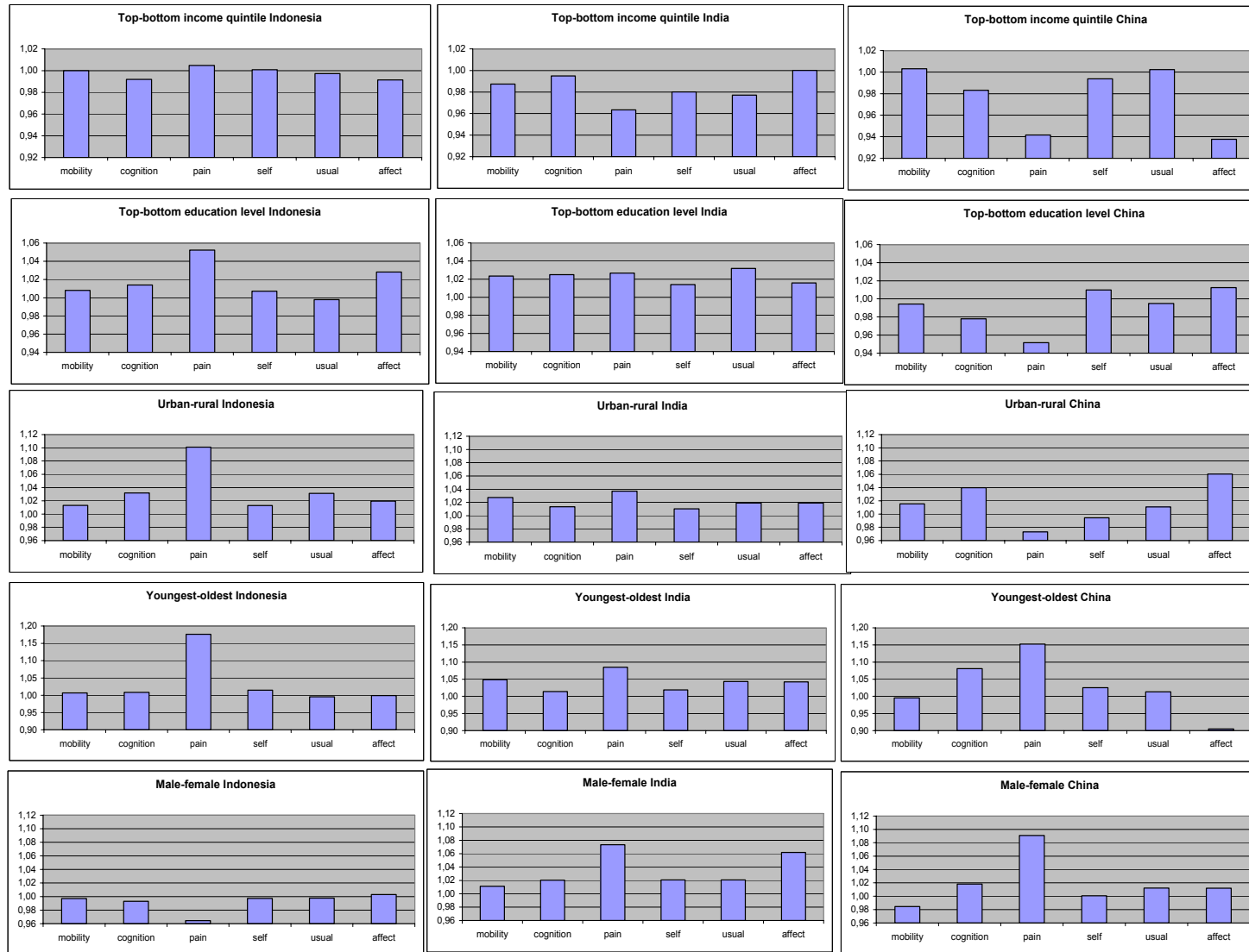
Figure 1: Relative probabilities of reporting very good health by socio-economic group