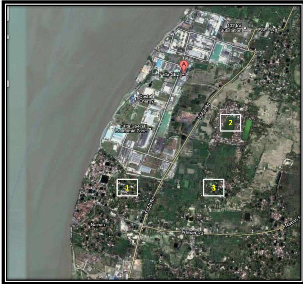
Figure 2.1: The villages studied in this paper.

Note: 1 – Nainan, 2 – New Gopalpur (“Higland”), 3 – Gopalpur.