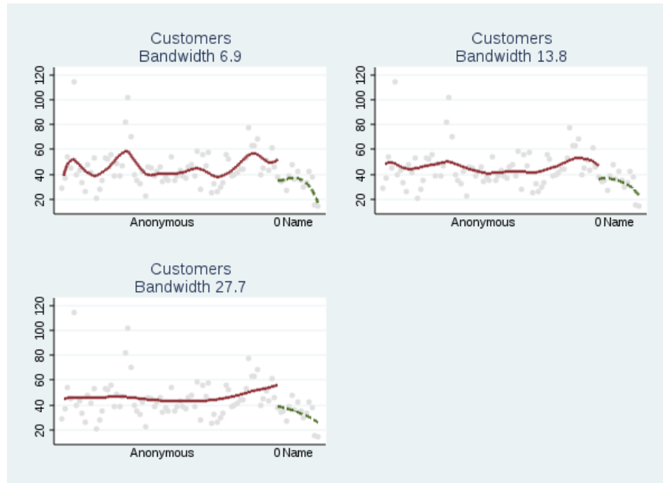
Figure 1: Regression Discontinuity on Daily Customers

This graph reports the results of a regression discontinuity specification at different bandwidths. The 0 on the x-axis specifies the date of the policy change (Nov 16, 2005). For a bandwidth of 6.9 the coefficient is -17.72 (p-value: 0.034), of 13.8 the coefficient is -10.64 (p-value: 0.060) and of 27.7 the coefficient is -17.04 (p-value: 0.002). We compare the time before the change happened and during the change.