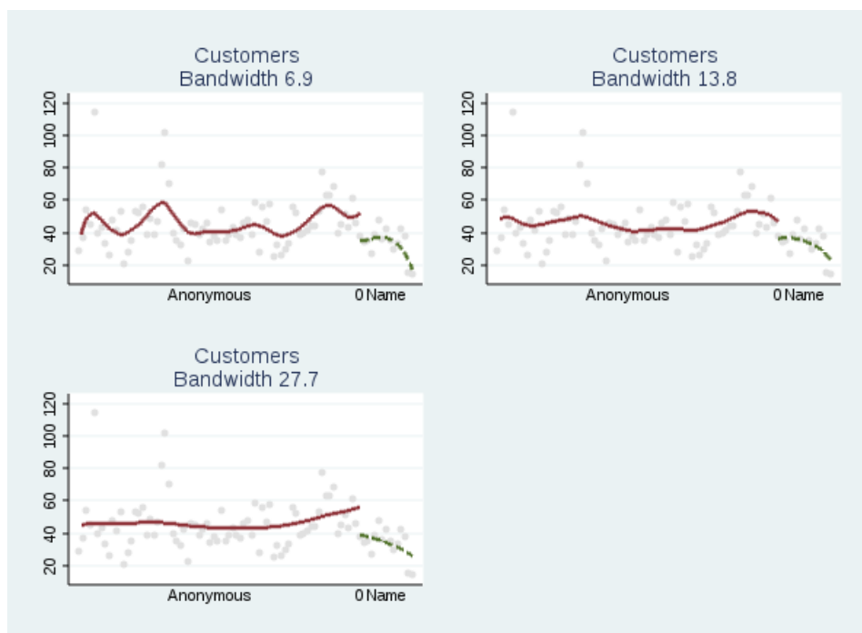
Figure 1: Regression Discontinuity on Daily Customers

This graph reports the results of a regression discontinuity specification at different bandwidths. The 0 on the x-axis specifies the date of the policy change (Nov 16, 2005). For a bandwidth of 6.9 the coefficient is -17.72 (p-value: 0.034), of 13.8 the coefficient is -10.64 (p-value: 0.060) and of 27.7 the coefficient is -17.04 (p-value: 0.002). We compare the time before the change happened and during the change.