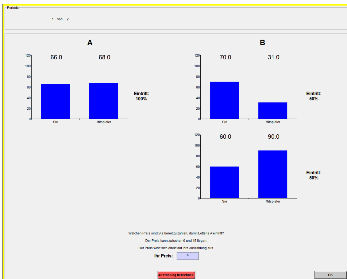
Fig. 1 Social lottery representation, reflecting the input of a price of 4.

Subjects were asked how much they were ready to pay to obtain social outcomes from lottery A rather than from lottery B. They were shown a representation of lotteries (Figure 1) and were invited to input a price that makes them indifferent between lottery A and lottery B. The figure reflects the input of a price of 4 for lottery A. They were told a random number would be drawn between 0 and 15 and that they would obtain lottery A at a price equal to that random number if the price they were willing to pay for lottery A was higher than that random number.