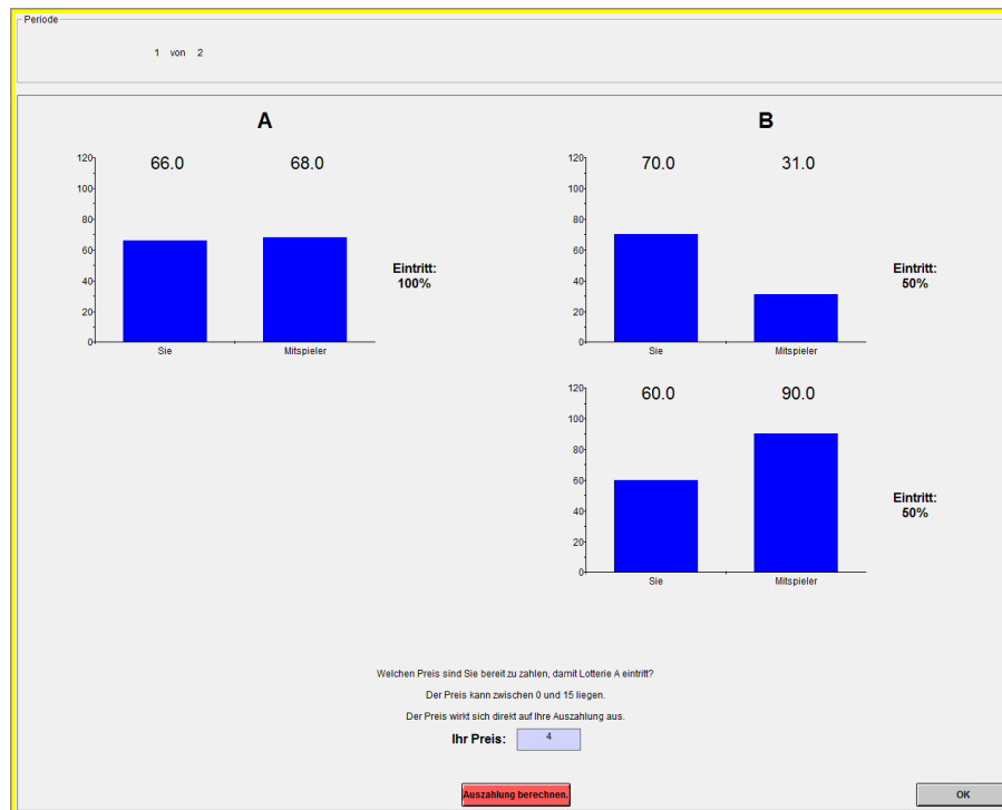
Fig. 2 Screen to calculate the payout at a price of 4

You will be asked to enter the highest price you are willing to pay to get lottery A instead of lottery B. This price can range from 0 to 15 ECU.