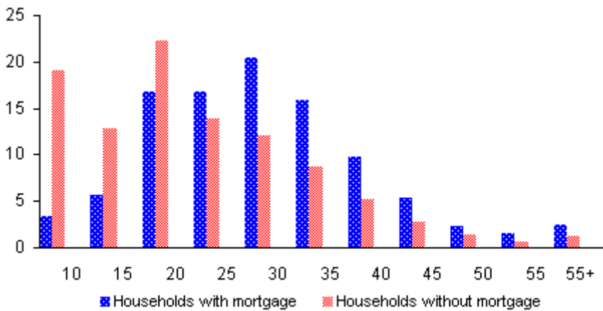
Chart 1: Household income distribution (Statistics of Family Accounts 2007) (x axis: monthly household net income, CZK 1000; y axis: %)

The income distribution of households with and without mortgages reveals that the indebtedness of low income Czech households is relatively limited. The income distribution of households with a mortgage is positively skewed compared to that of households without a mortgage.