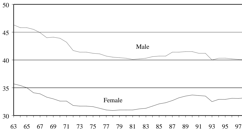
Figure 2 Average Weekly Hours of Work for Employed Males and Females Aged 18 to 64.