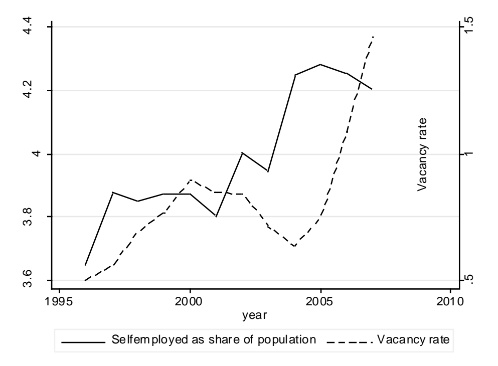
Figure 2. Vacancy and self-employment rates among women 1996-2007, in percent

Source: Public Employment Agency and Statistics Sweden