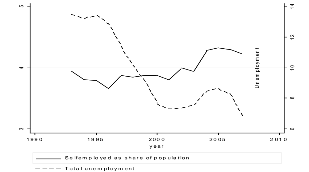
Figure A 2. Unemployment and self-employment among women 1993-2007