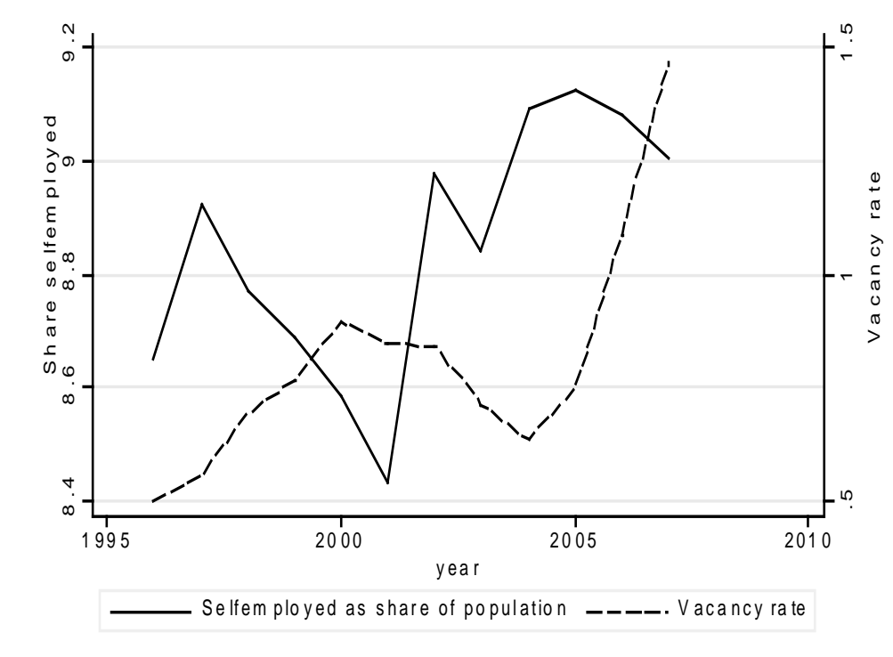
Figure 1. Vacancy and self-employment rates among men 1996-2007, in percent

Source: Public Employment Agency and Statistics Sweden