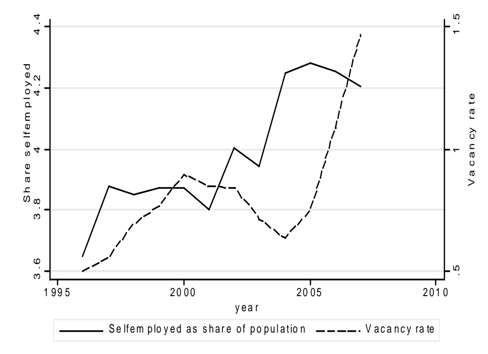
Figure 2. Vacancy and self-employment rates among women 1996-2007, in percent

Source: Public Employment Agency and Statistics Sweden