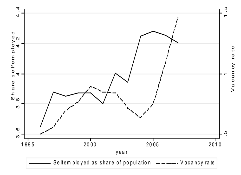
Figure 2. Vacancy and self-employment rates among women 1996-2007, in percent

Source: Public Employment Agency and Statistics Sweden