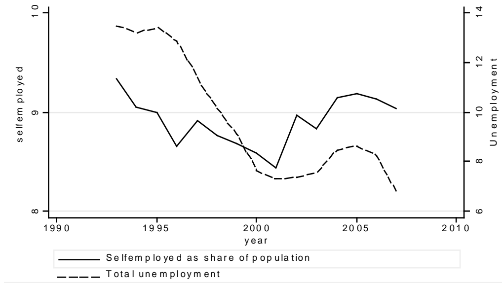
Figure A 1. Unemployment and self-employment among men 1993-2007