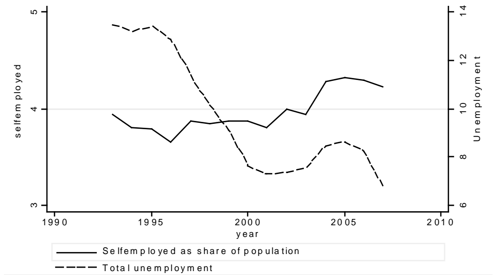
Figure A 2. Unemployment and self-employment among women 1993-2007