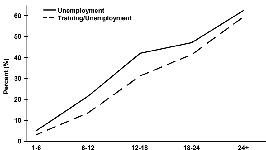
Figure 2. “How long spell (in months) of unemployment, or training/unemployment, is required before you consider a job applicant as less suitable?” (866 respondents)

The responses suggest that participation in a training program tends to mitigate the stigma from unemployment. 30 Figure 2 merges the responses to Questions 14a–b. Comparing the distributions, the one showing the response to Question 14b has more mass to the right, which suggests that training tends to prolong the time required for the stigma from unemployment to develop. A formal statistical test gives the same message. Of the 866 respondents who replied to both Question 14a and Question 14b, 40 indicated that there was less stigma from regular unemployment than from unemployment/training, 232 that there was less stigma from unemployment/training, and 594 that the states conveyed the same stigma. To obtain a p-value for this outcome, consider a binomial distribution with p = .5 and N = 272 ; i.e. a distribution with the same probability that a respondent picks either of two alternatives. Our 40 “yeas” and 232 “nays” have been drawn from this distribution with p-value < .0001.