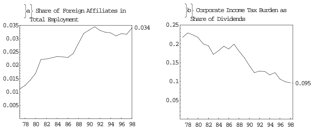
Figure 4.3 (a)-(b): Foreign ownership and corporate tax burden, 1977-1998

A shortcoming of the data is that it measures foreign ownership from outside the U.S., i.e., it does not include cross-state ownership (the tax exporting motive depends on the total ownership share from outside the state). Foreign investment is probably highly correlated with cross-state investment (on the state level), so the coefficient in the regression of \tau on foreign ownership will measure the combined effect of foreign ownership and cross-state ownership.