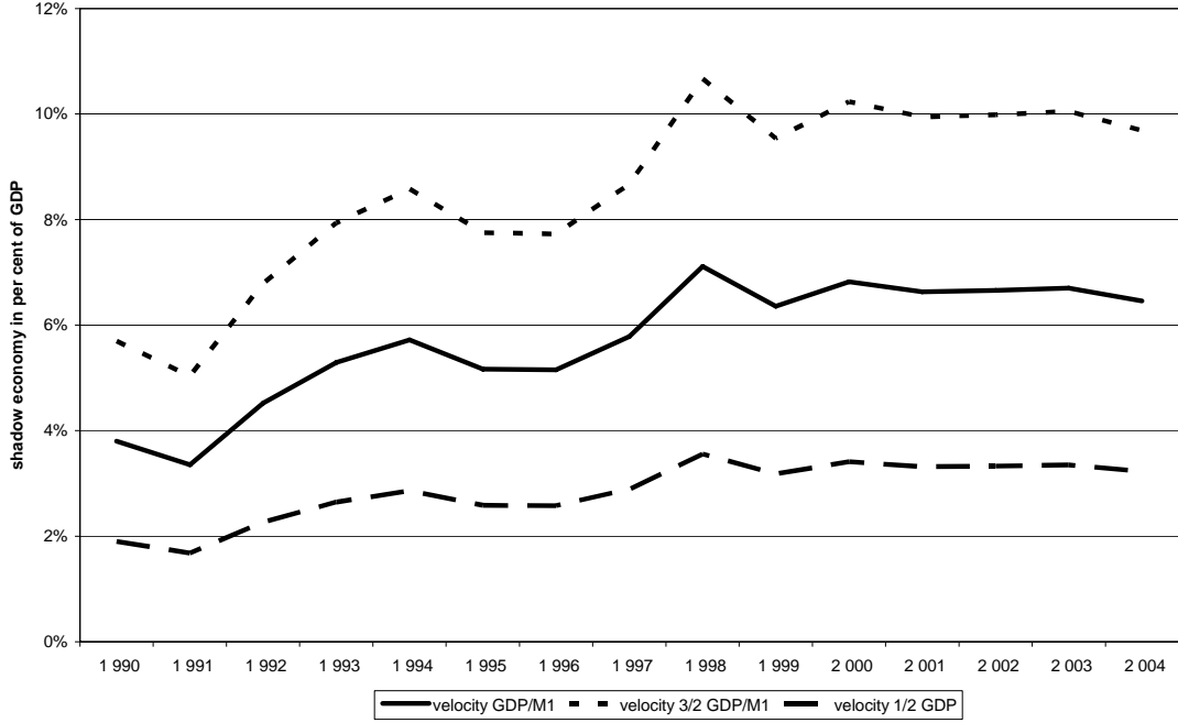
Figure 3. The shadow economy in Sweden between 1990 and 2004 given velocity equals GDP/M1, 0.5GDP/M1 or 1.5GDP/M1.