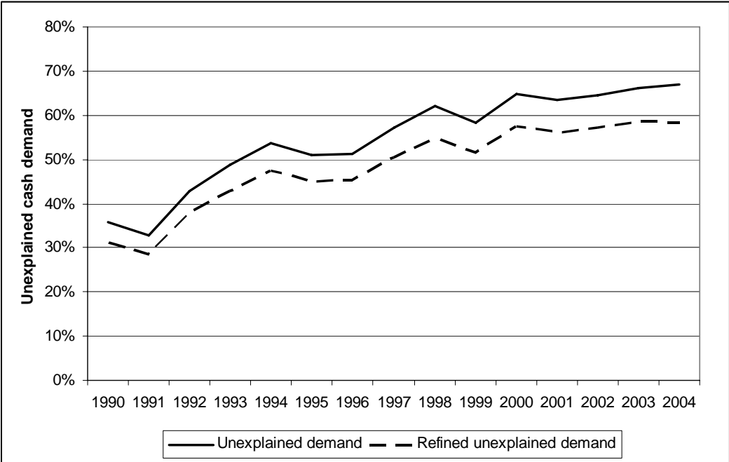
Figure 2. Percentage of currency in circulation not used in recorded economic activity.

Part of the stock of cash officially in circulation is likely to have been lost or accidentally destroyed. In the 2001 Euro cash changeover process, a number of European national currencies were replaced by the Euro. On average 90 percent of the national currencies were redeemed, but the national differences were large. 12 In the following, we assume this average of 10 percent not redeemed to be a fair approximation of lost and destroyed cash in Sweden. This reduces the stock of cash in circulation by 10 percent which, in turn, reduces the unexplained demand. However, accounting for second-hand trade and lost cash, the unexplained demand for cash was still 58 percent of M0 in 2004 (see the dotted line in Figure 2).