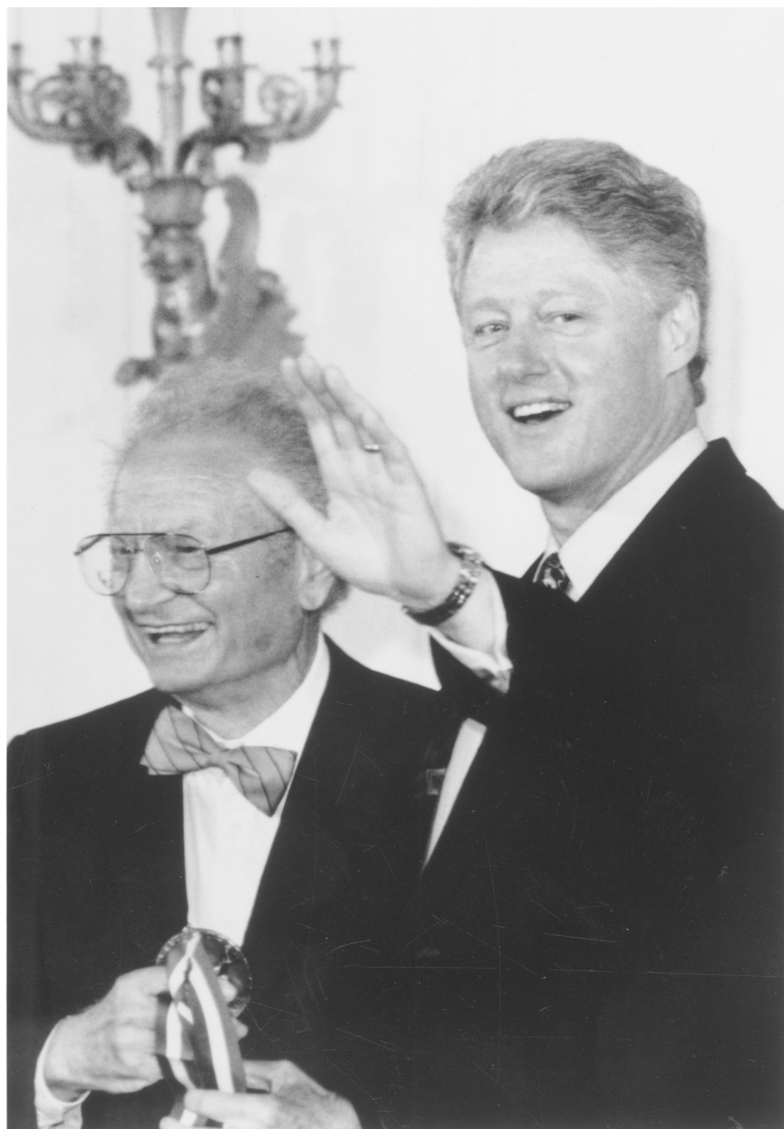
FIGURE 5. Paul Samuelson with Bill Clinton in White House.