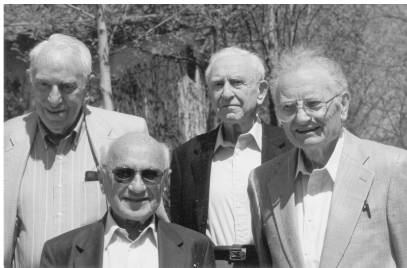
FIGURE 3. Left to right in back: James Tobin and Franco Modigliani. Left to right in front: Milton Friedman and Paul A. Samuelson. All four are Nobel Laureates in Economics.

On the other hand, within any "school," schisms do tend to arise. Tobins and Modiglianis never approved of Robert Eisner or Sidney Weintraub as