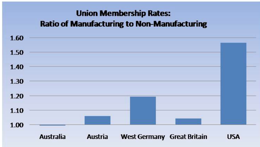
Figure 3: Union Membership Ratios

as economists tend to reject the idea that there is a clear, one-directional link between a distinct American culture and whatever differences in public policies that exist between the US and other industrialized nations. 25