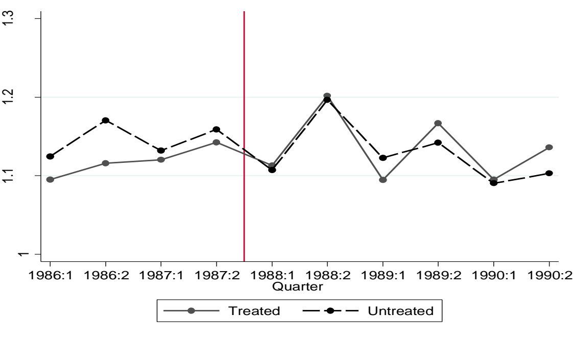
Figure 1. Average log duration: Comparing treatment and control group for the period 1986-1990.