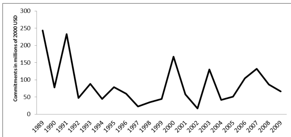
Figure 2: Evolution of general budget support to Benin (US$ million, constant 2000)