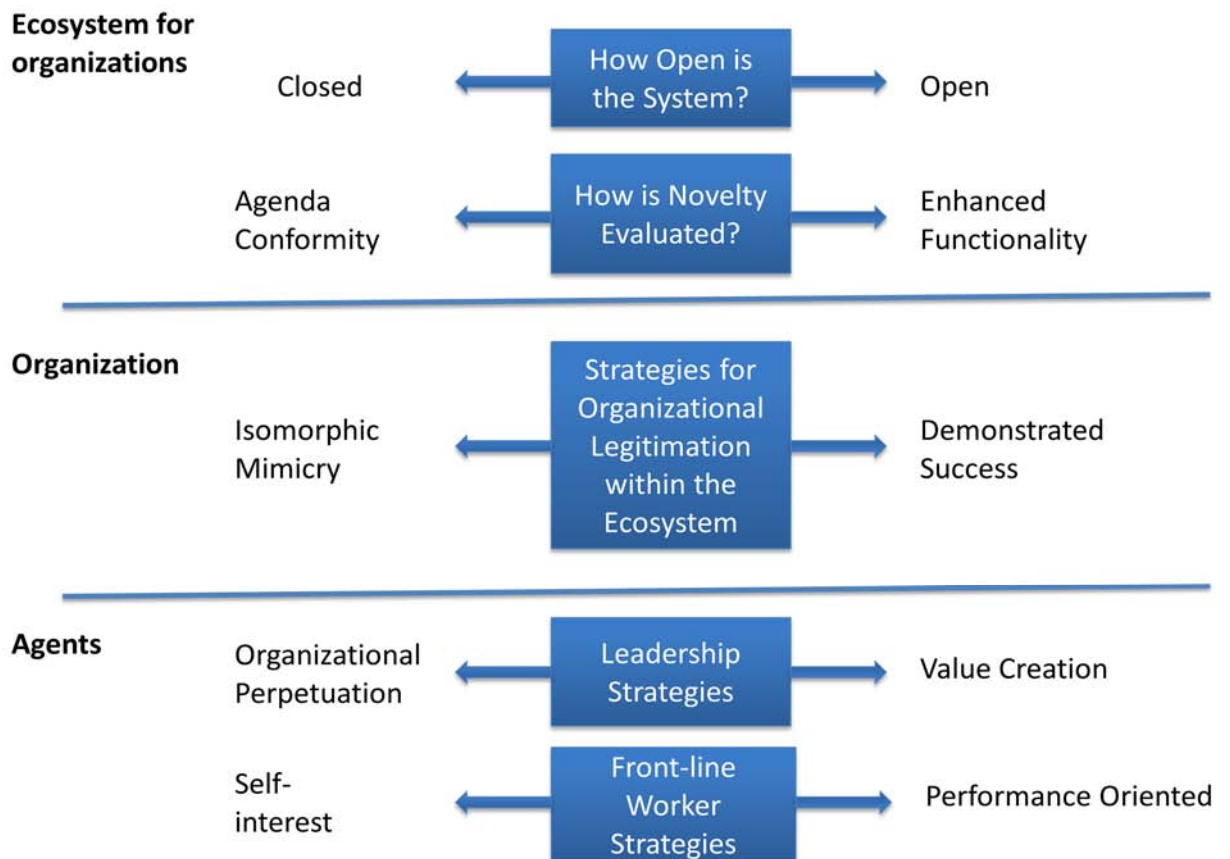
Figure 1: Tensions playing out at different levels of engagement in development