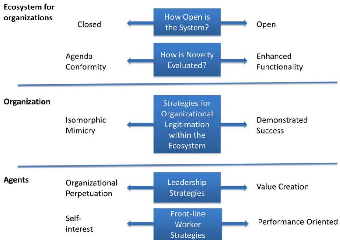
Figure 2: Constituent elements of an ecology of implementation