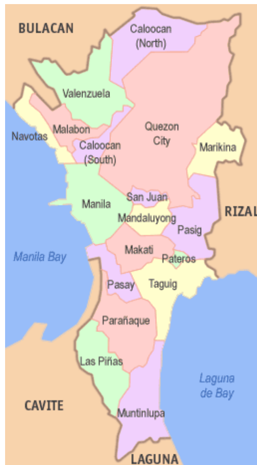
Figure 1: Metro Manila map

Figure 2, compare the rates of modern contraceptive use of women 20 to 45 years old in various cities of the National Capital Region between 1993 and 2008, based on data from the Demographic and Health Surveys. 3 All cities in the National Capital Region, except for Manila, exhibit a clear