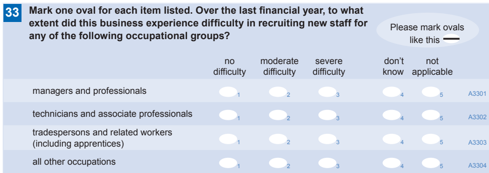
Figure 2: Recruitment difficulties question

Occupational groups are defined in the immediately preceding survey question as: