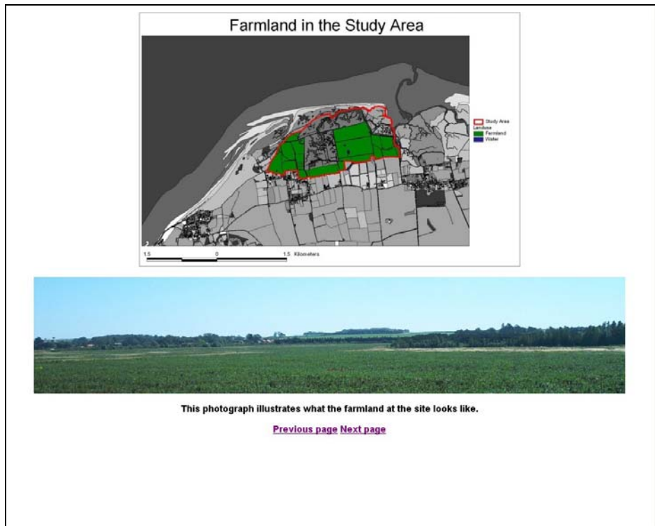
Figure 2: Screenshot example of the introductory information presented to all participants in the experiment: Location and photo of agricultural land within the survey area

Once the base map and photo information was delivered to all participants, unbeknown to those subjects, the experiment then divided into three treatments. These were devised to