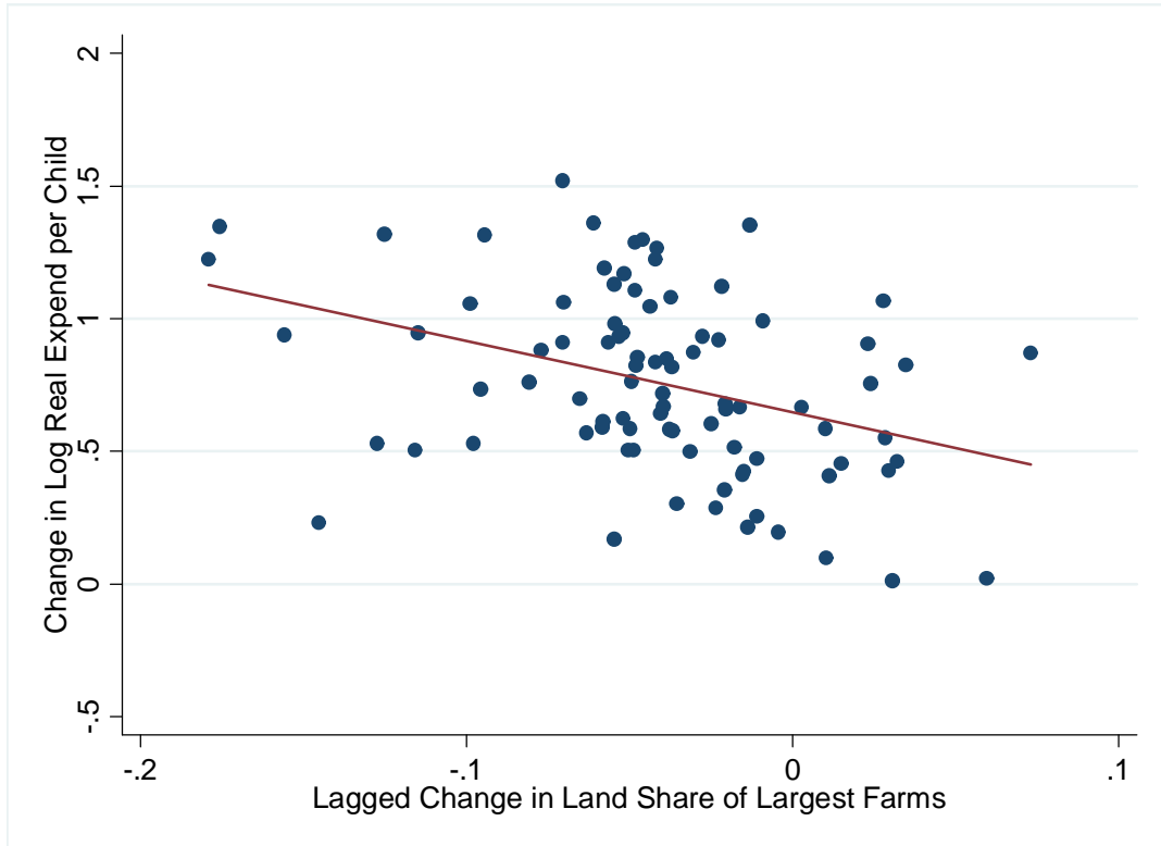
Figure 3. Changes in Education Expenditure per Child and Changes in the Concentration in Landownership.

** indicates significance at the 5% level, * at the 10% level