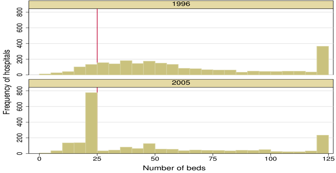
Figure 2: Size of rural hospitals, 1996 and 2005

The DRG are clusters of related diagnoses that use similar resources. Medicare uses DRGs to determine prospective payment for non-CAH hospital admissions. Roughly, the hospital is paid the base rate times the DRG weight plus some adjustments. We also merge in the DRG weight information.