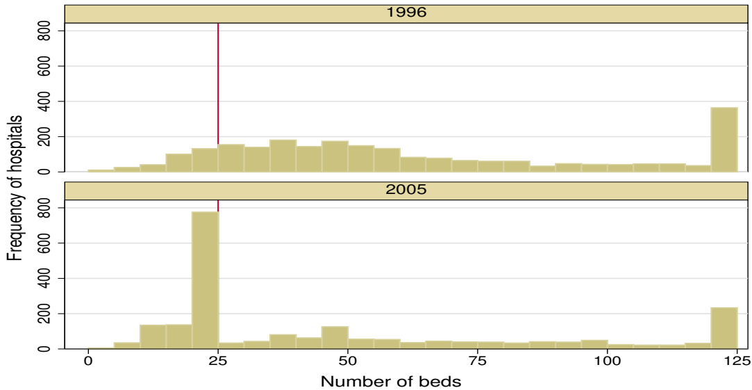
Figure 2: Size of rural hospitals, 1996 and 2005

The DRG are clusters of related diagnoses that use similar resources. Medicare uses DRGs to determine prospective payment for non-CAH hospital admissions. Roughly, the hospital is paid the base rate times the DRG weight plus some adjustments. We also merge in the DRG weight information.