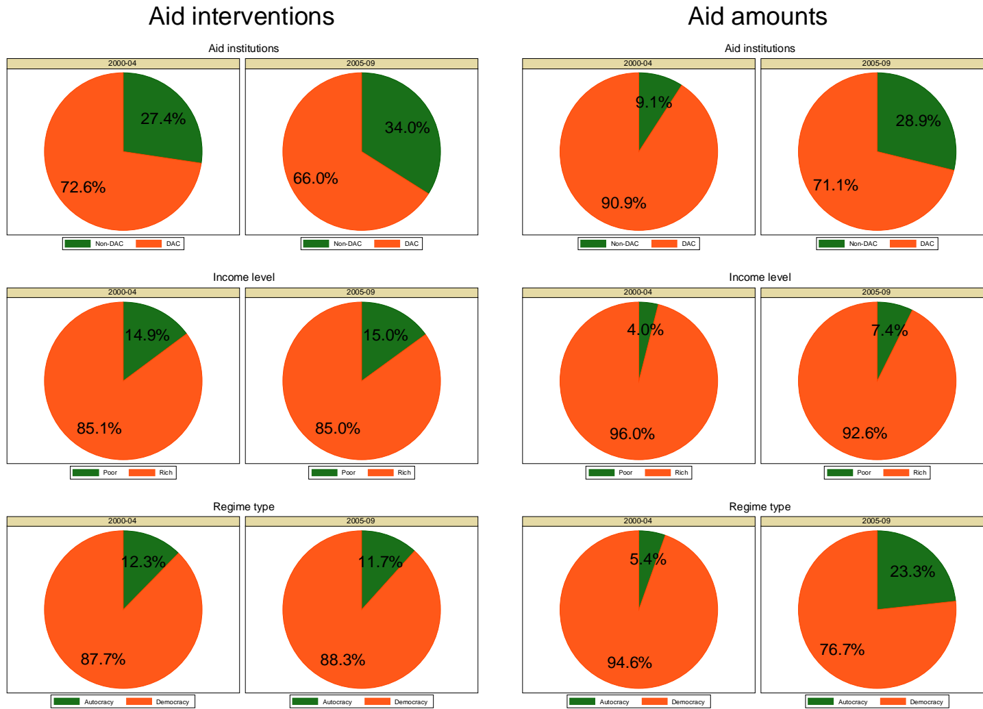
Figure 1: Emergency aid over time and by donor group (2000-2009)