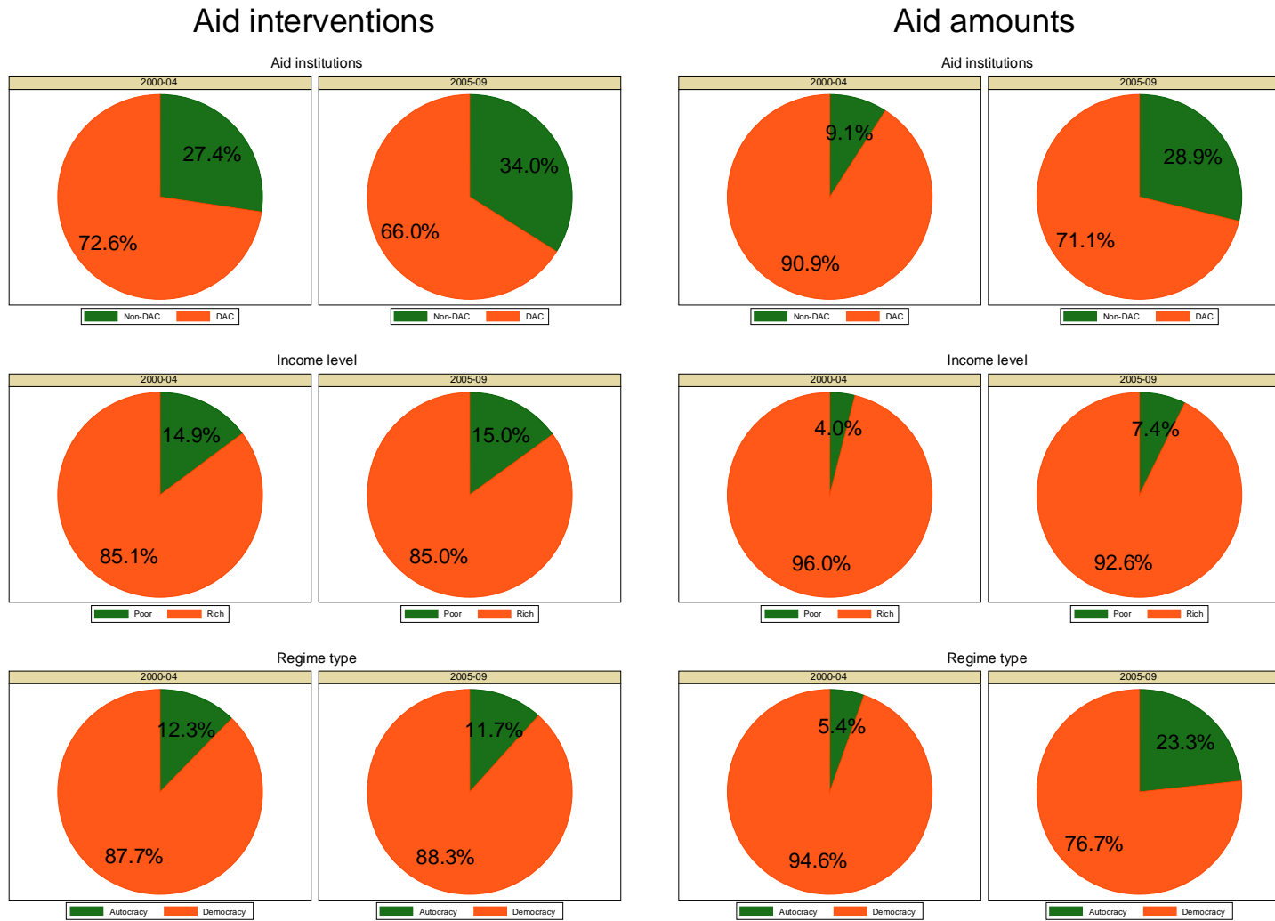
Figure 1: Emergency aid over time and by donor group (2000-2009)