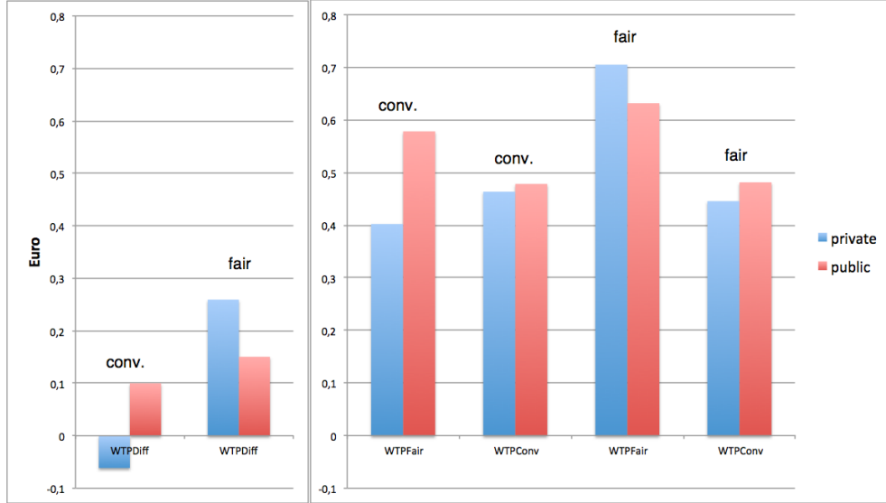
Figure 1: Averages of WTP by treatment and by chocolate choice. Left panel: averages of premium in willingness to pay for Fairtrade, right panel: averages of willingness to pay for Fairtrade and conventional chocolate.

the treatment effect) between the groups of participants shows whether image concerns interact with our measure of intrinsic motivation.