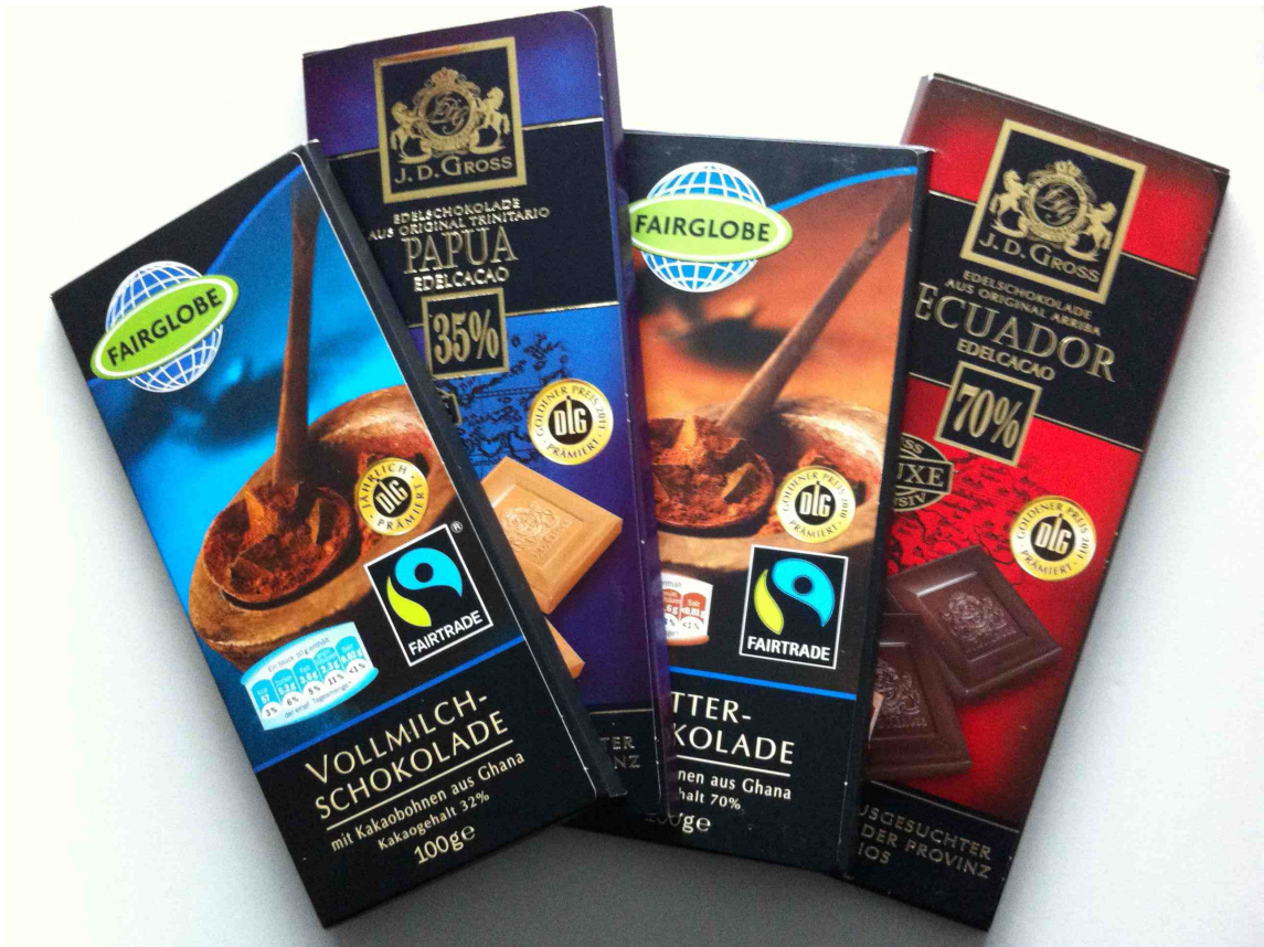
Figure 3: We used milk chocolate to derive a proxy of intrinsic preferences and dark chocolate to elicit willingness to pay.